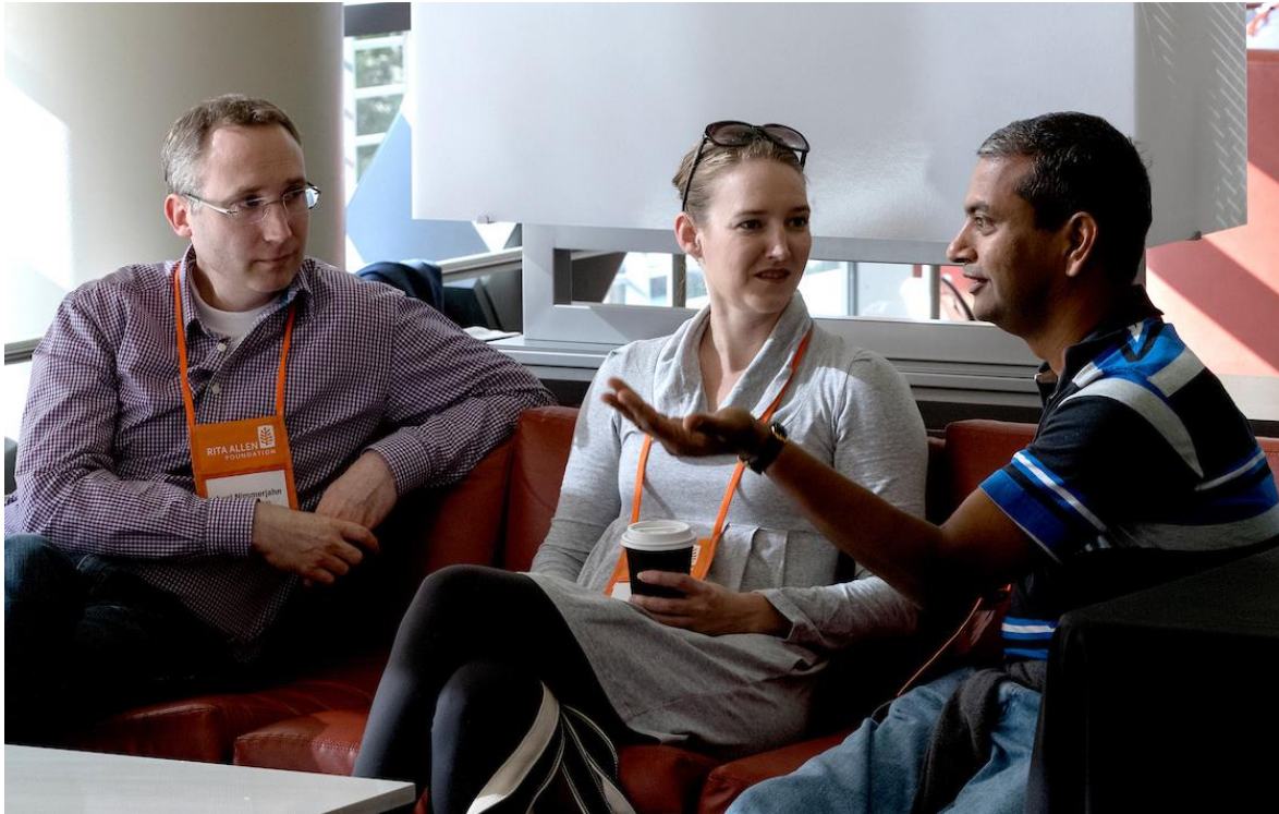
Rita Allen Foundation Scholars