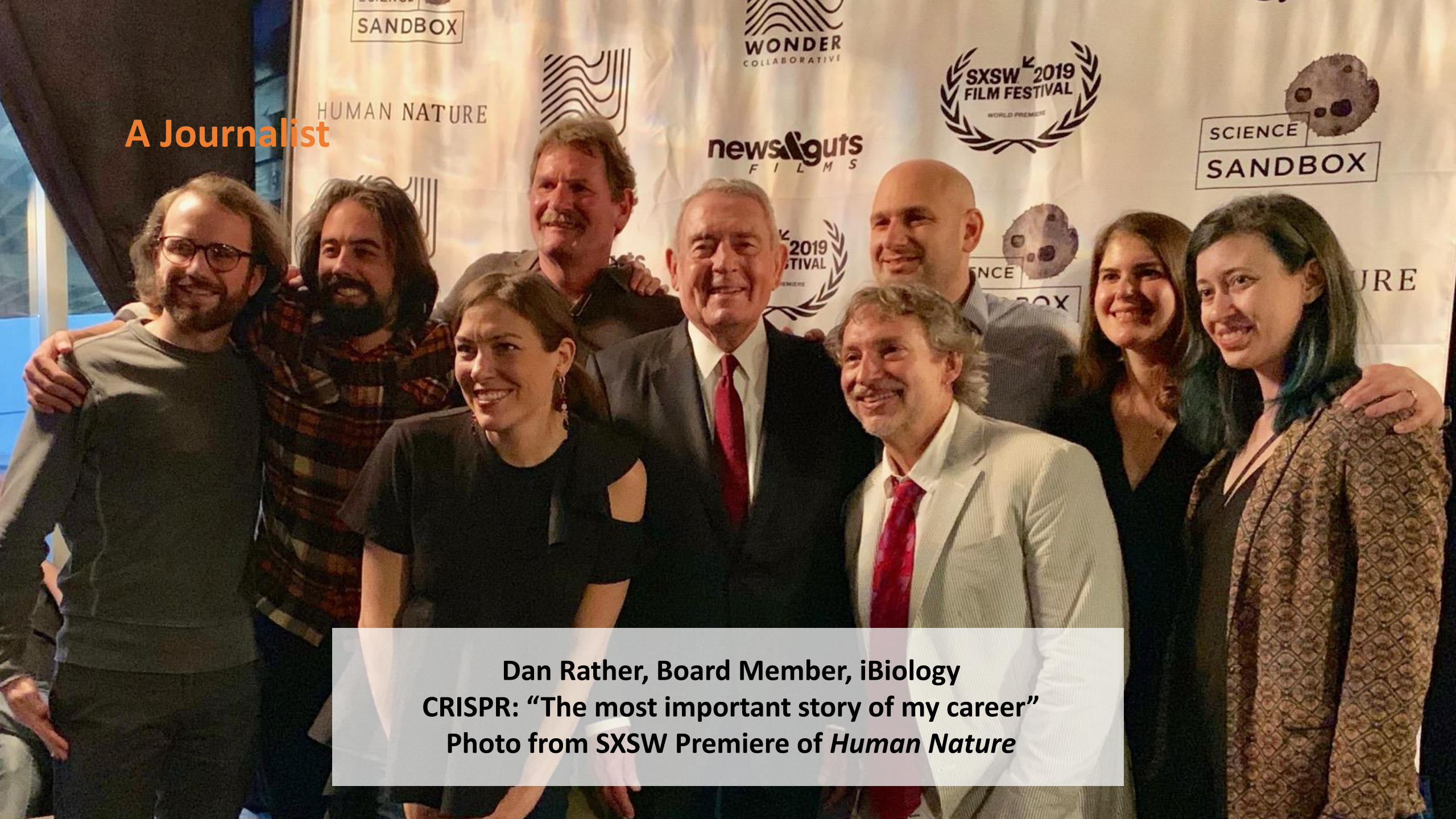
Dan Rather, Board Member, iBiology CRISPR: "The most important story of my career"